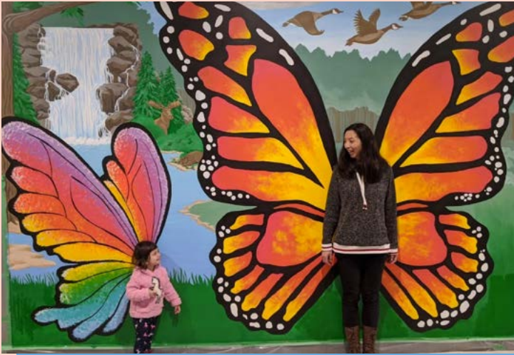
Woodlands Wings Public Mural at Aaniin Community Centre