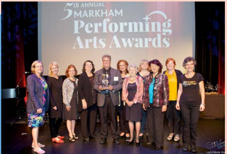
Markham At the Movies