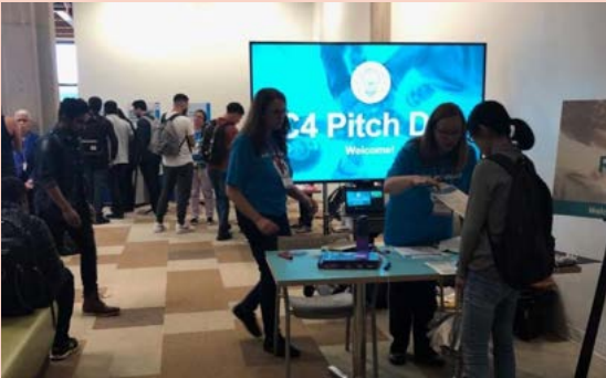
York University's Cross Campus Capstone Classroom

We also worked closely with the City of Markham on commissioning a public mural – Woodland Wings - at the Aaniin Community Centre.